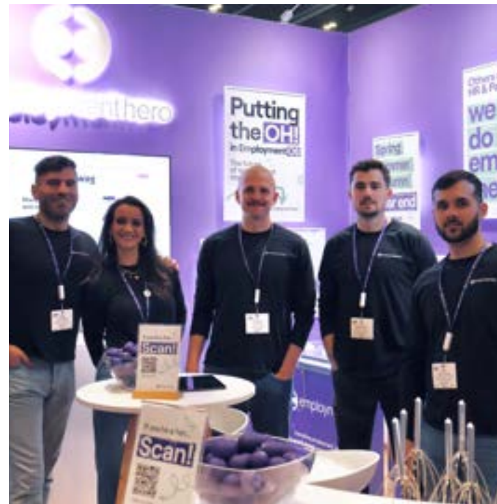
Exhibit at The Show

Having a stand provides countless benefits over and above the obvious face-to-face advantages you gain from interacting with pre-vetted decision-makers visiting the show.